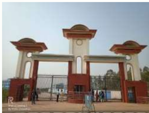
The Chemistry Department, Bankura University

'International Conference on Current Trends in Chemistry' (ICCTC-2025) is being organized by the Department of Chemistry, Bankura University, India on 23 rd December, 2025. This international conference intends to bring the eminent scientists, and young researchers from several disciplines across India together to provide a common platform for sharing their achievements and newer directions of research. The ICCTC-2025 conference is focused on broad area of recent advances in chemistry. Interested faculties, research scholars and students are requested to attend the conference.